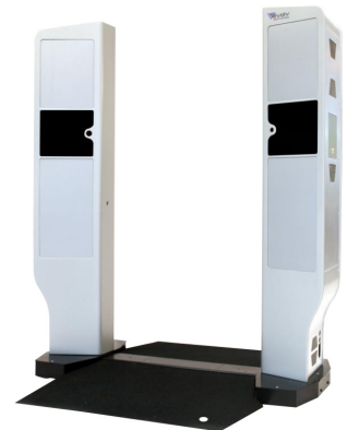
Edge: Rapid Detection of Person-Borne Mass Casualty Threats with Limited Personal Divestment.